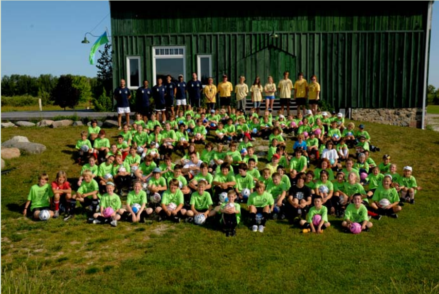
120 Campers Enjoyed a Week of Soccer!