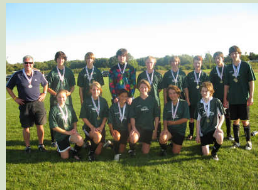
U16 2nd Place Champions—Team 2