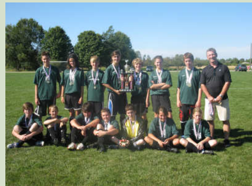
U14 Champions—Team 1