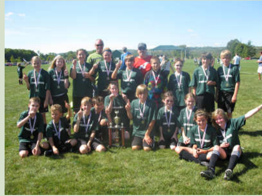
U12 Champions—Champions—Team 3