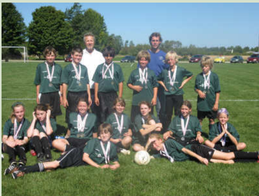
U12 4th Place Champions—Team 2