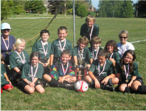
U10 Champions—Team 1