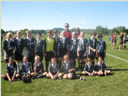
U12 2nd Place Champions—Team 1